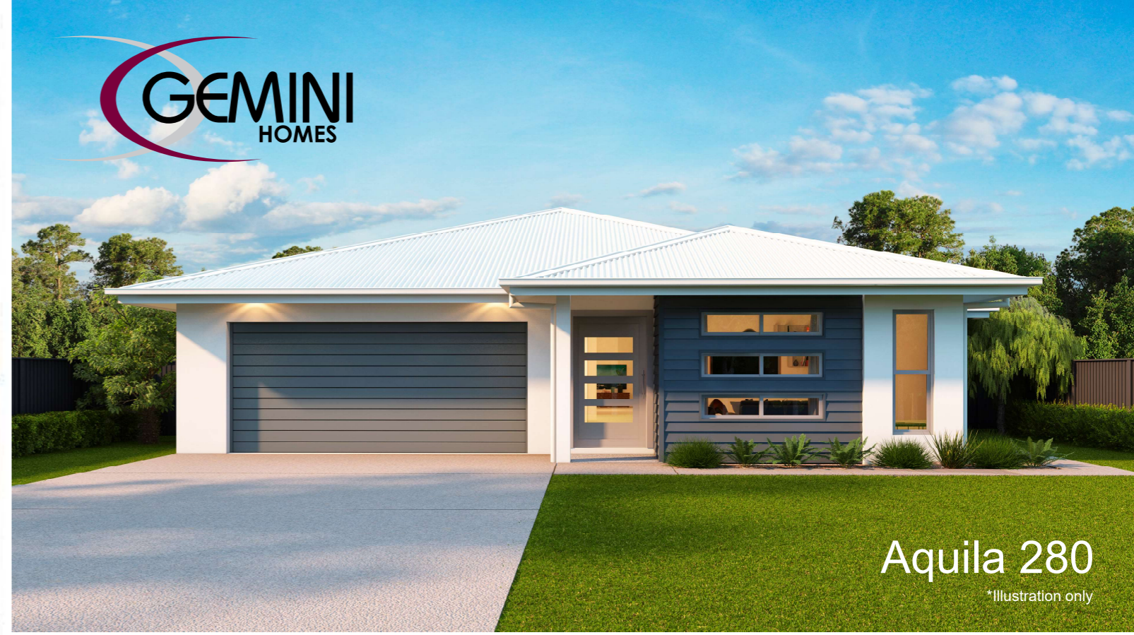
Aquila 280 *Illustration only