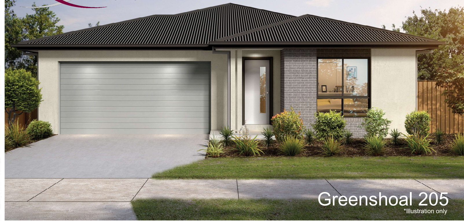
Greenshoal 205 *Illustration only