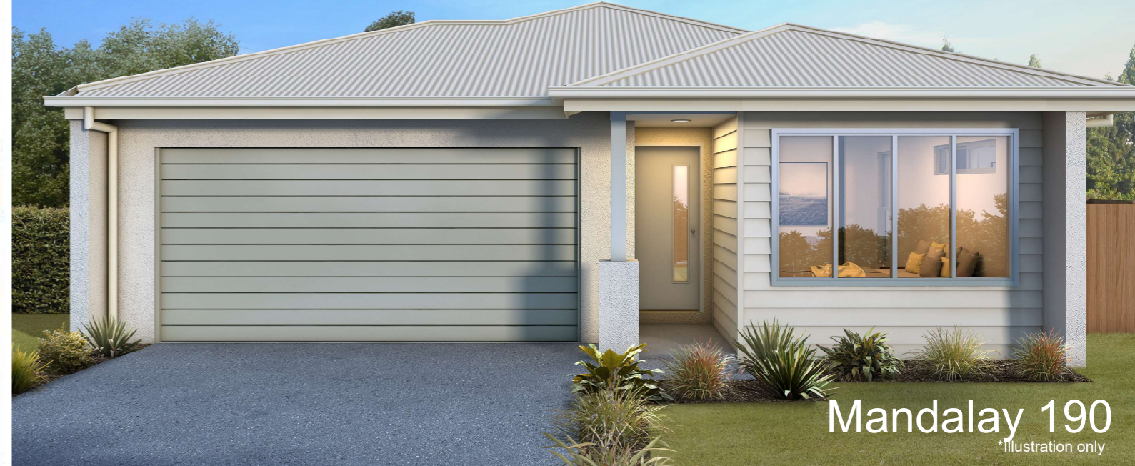
Mandalay 190 *Illustration only