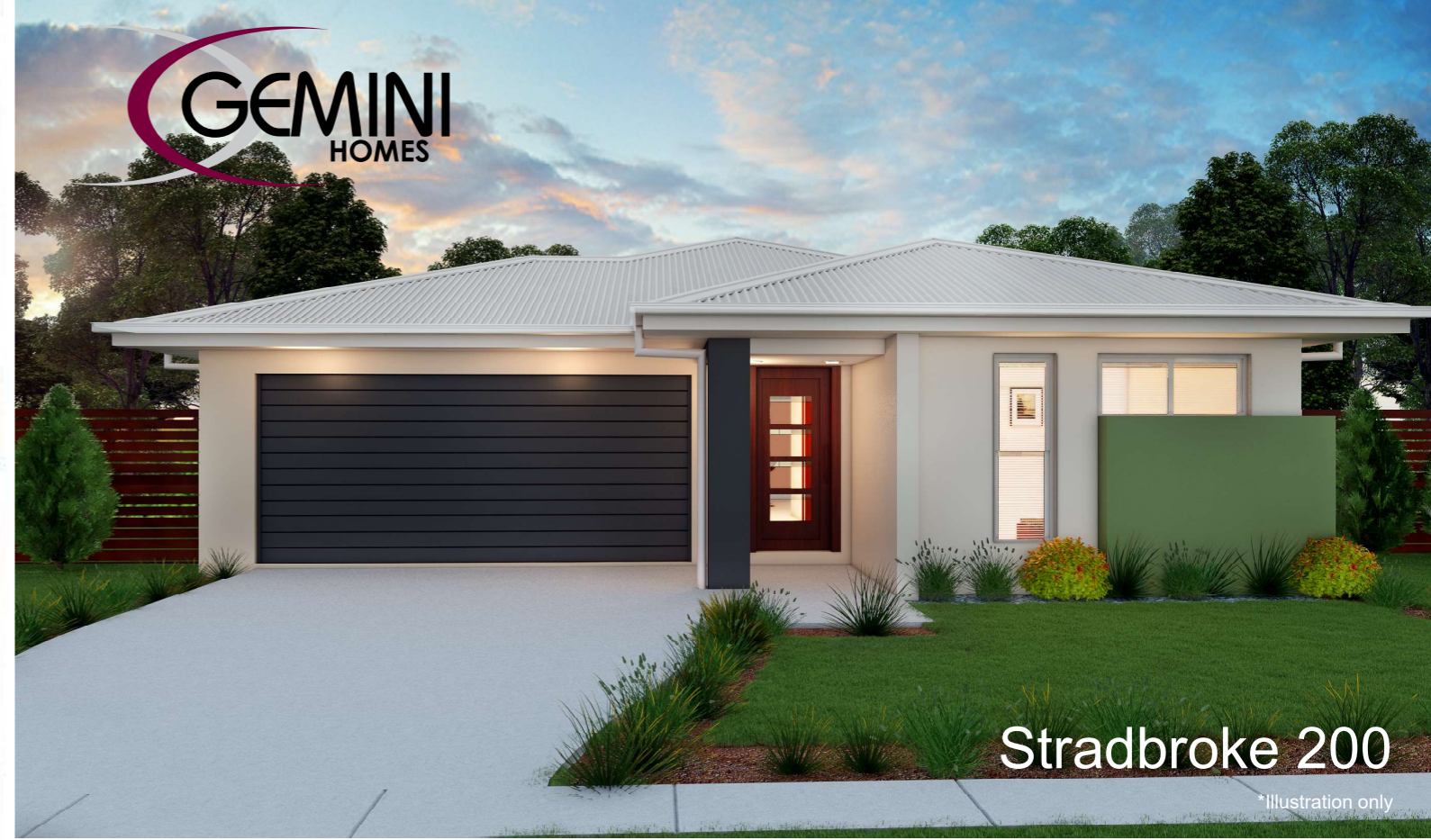
Stradbroke 200 *Illustration only