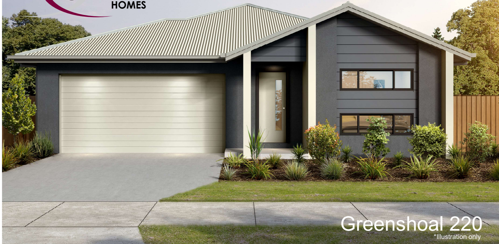
Greenshoal 220 *Illustration only