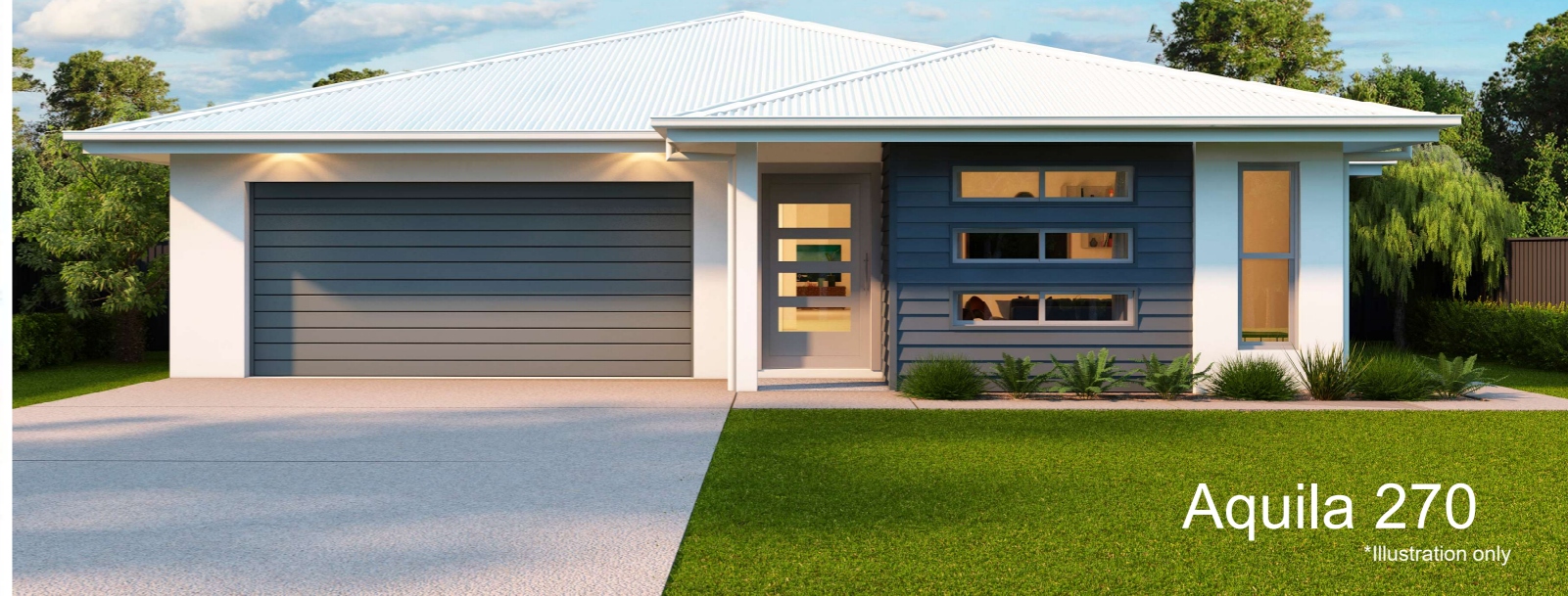
Aquila 270 *Illustration only