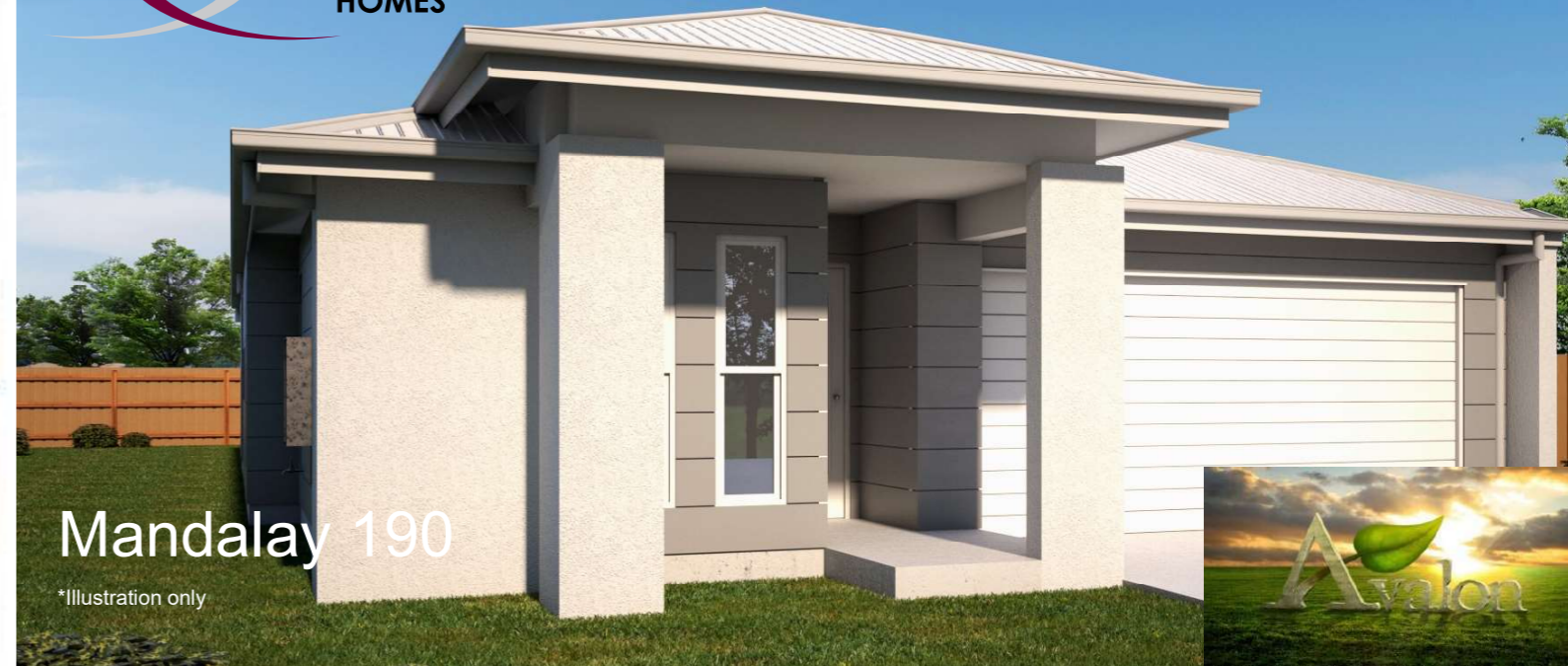
Mandalay 190 *Illustration only