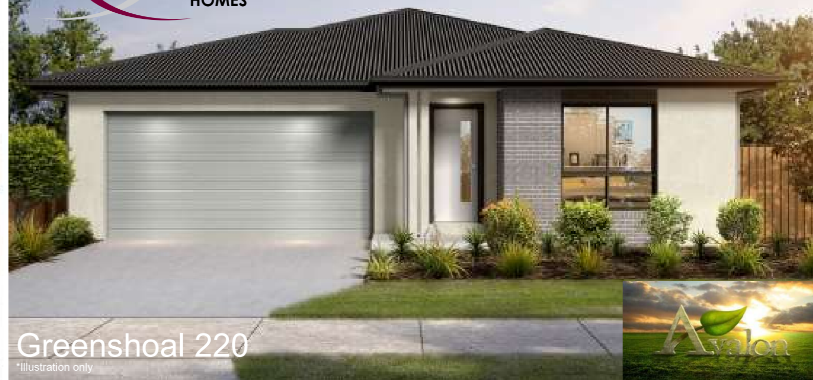
Greenshoal 220 *Illustration only