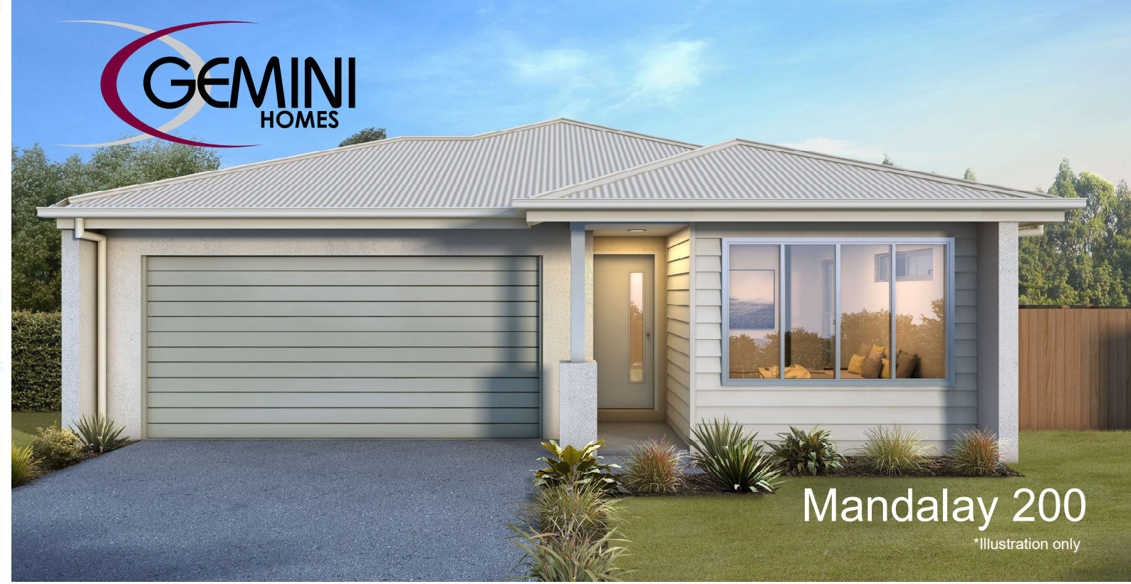
Mandalay 200 *Illustration only