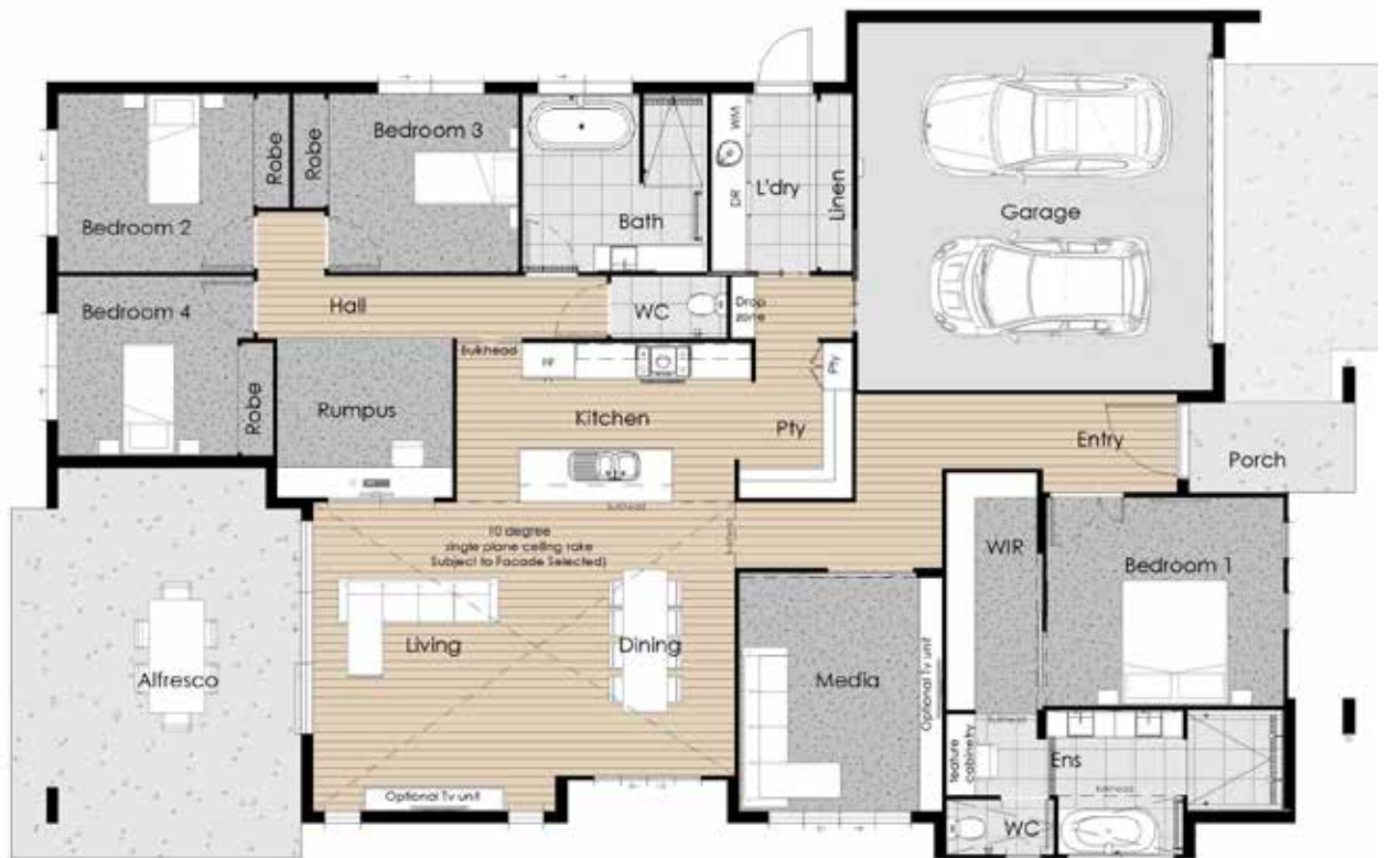
(Floor plan as displayed)