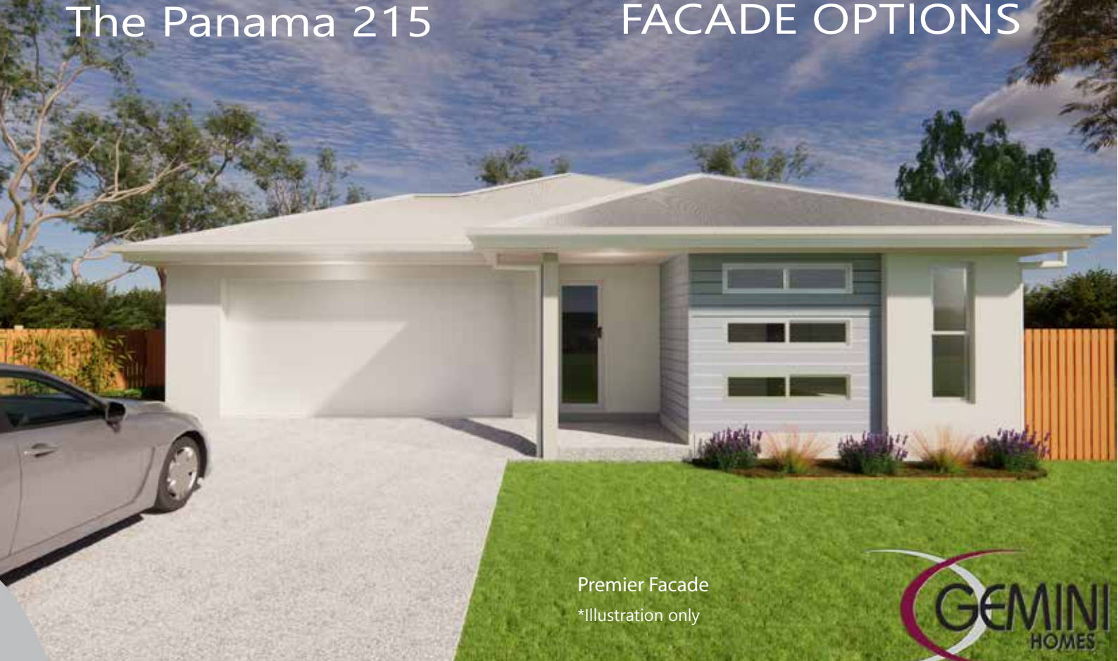
Premier Facade *Illustration only