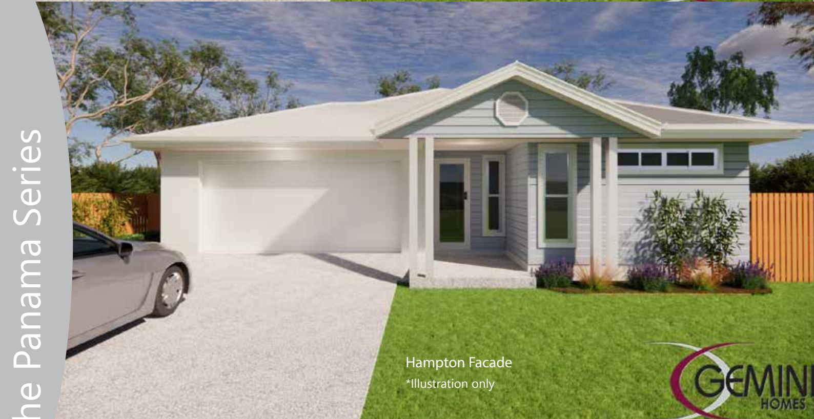
Hampton Facade *Illustration only