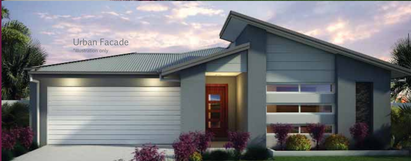
Urban Facade *Illustration only

All drawings are artistic impressions only. Any furniture shown is for illustration purposes only and not included in the price. Gemini Homes (QLD) Pty Ltd reserves the right to change prices and inclusions without notice or obligation. All plans are exclusively owned by Gemini Homes (QLD) Pty Ltd and must not be copied or reproduced wholly or in part in any form without written permission of Gemini Homes (QLD) Pty Ltd. This includes making changes with intent to change the plan by 10% or more. Any infringement on this Copywrite will result in legal action being taken by Gemini Homes (QLD) Pty Ltd against all persons involved. Please note minimum width measurements are subject to individual site plans. QBCC: 1120226