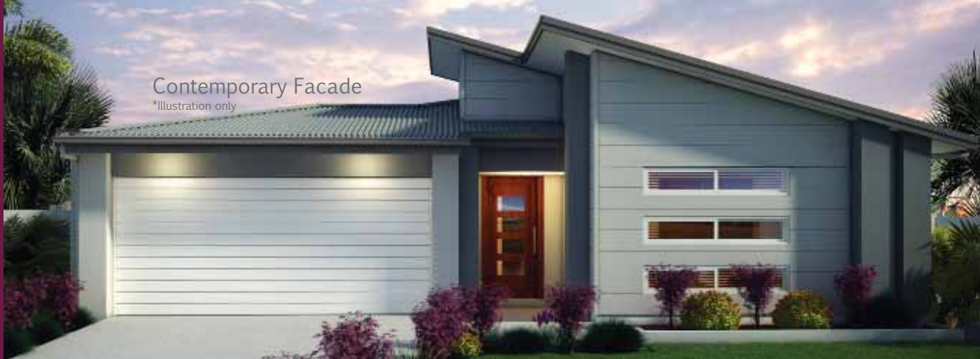
Contemporary Facade *Illustration only