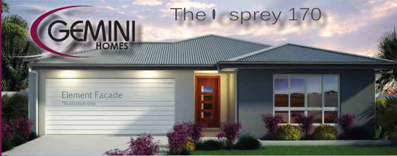
Element Facade *Illustration only