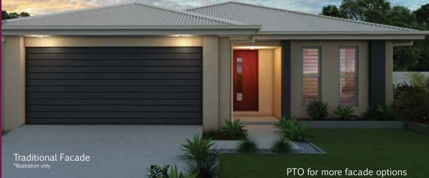
Traditional Facade *Illustration only